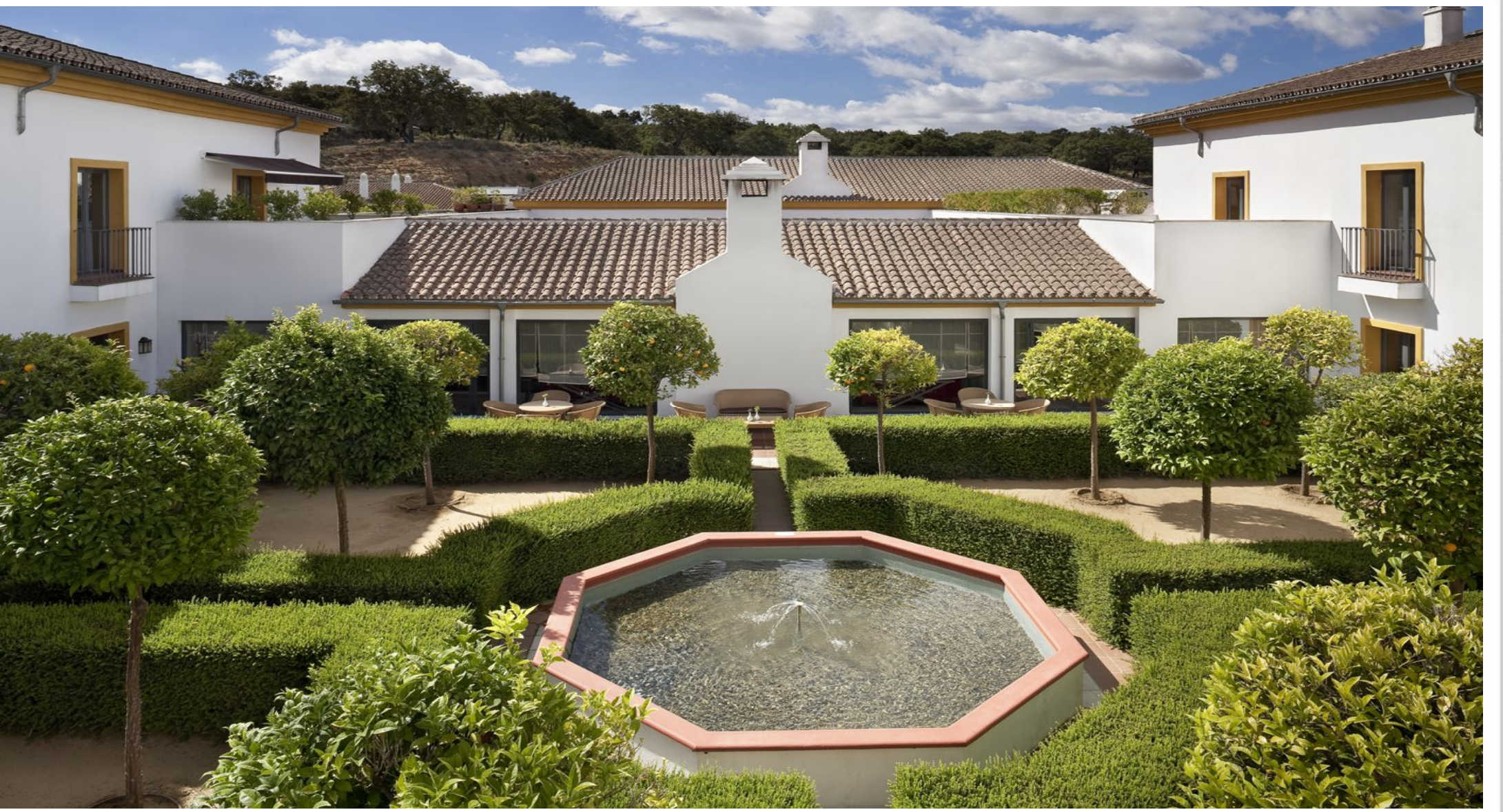
Private & confidential...