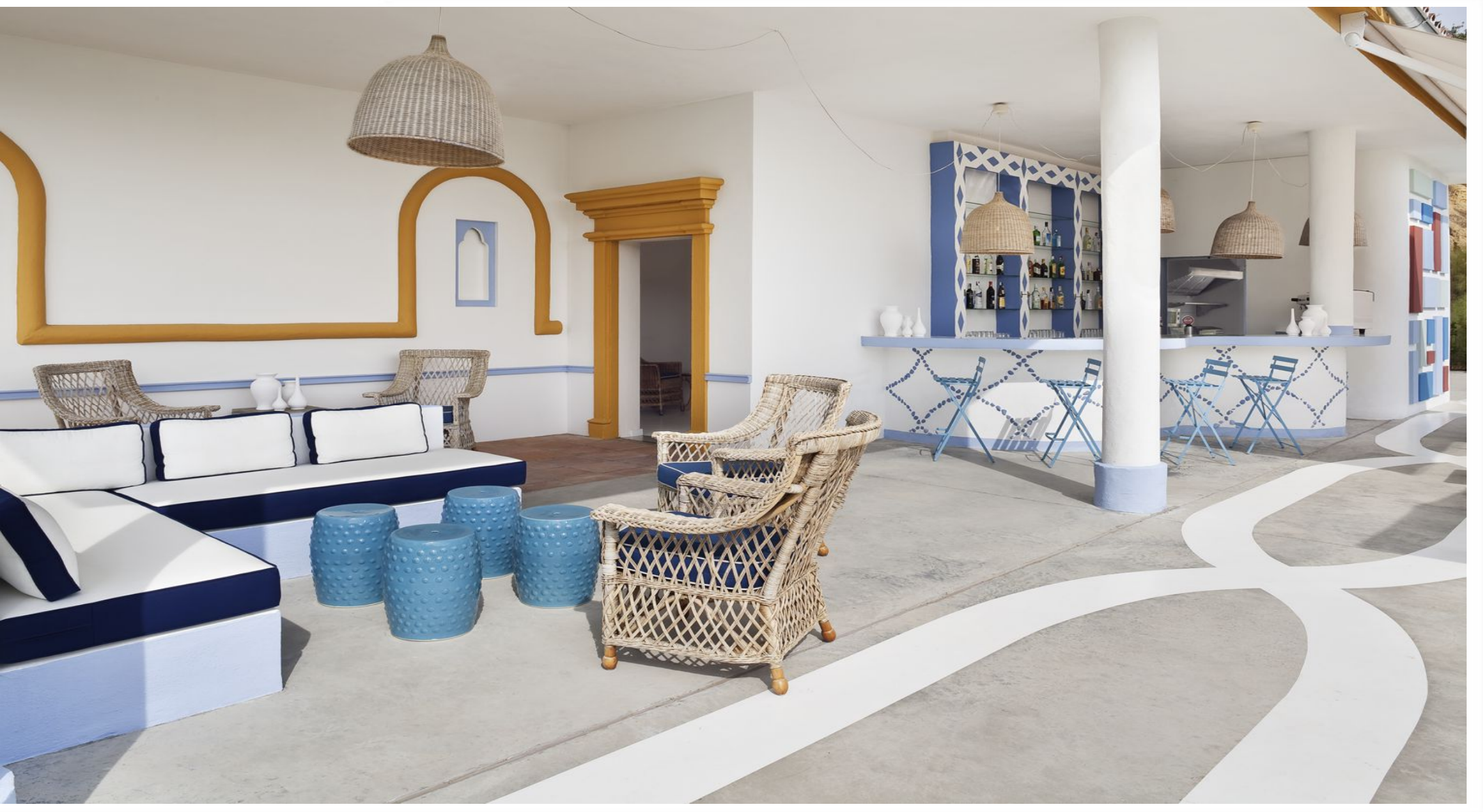
Private & confidential...