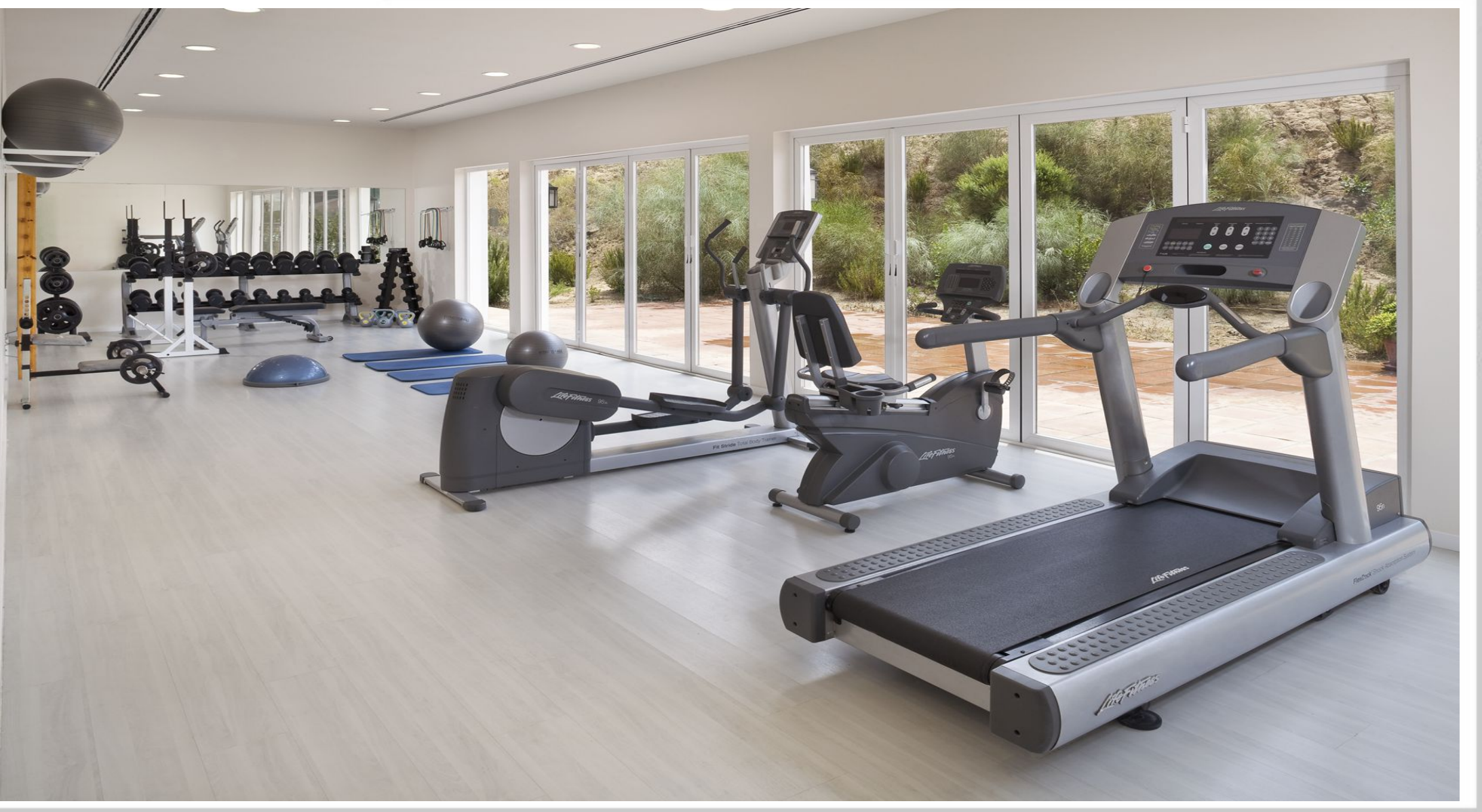
Private & confidential...