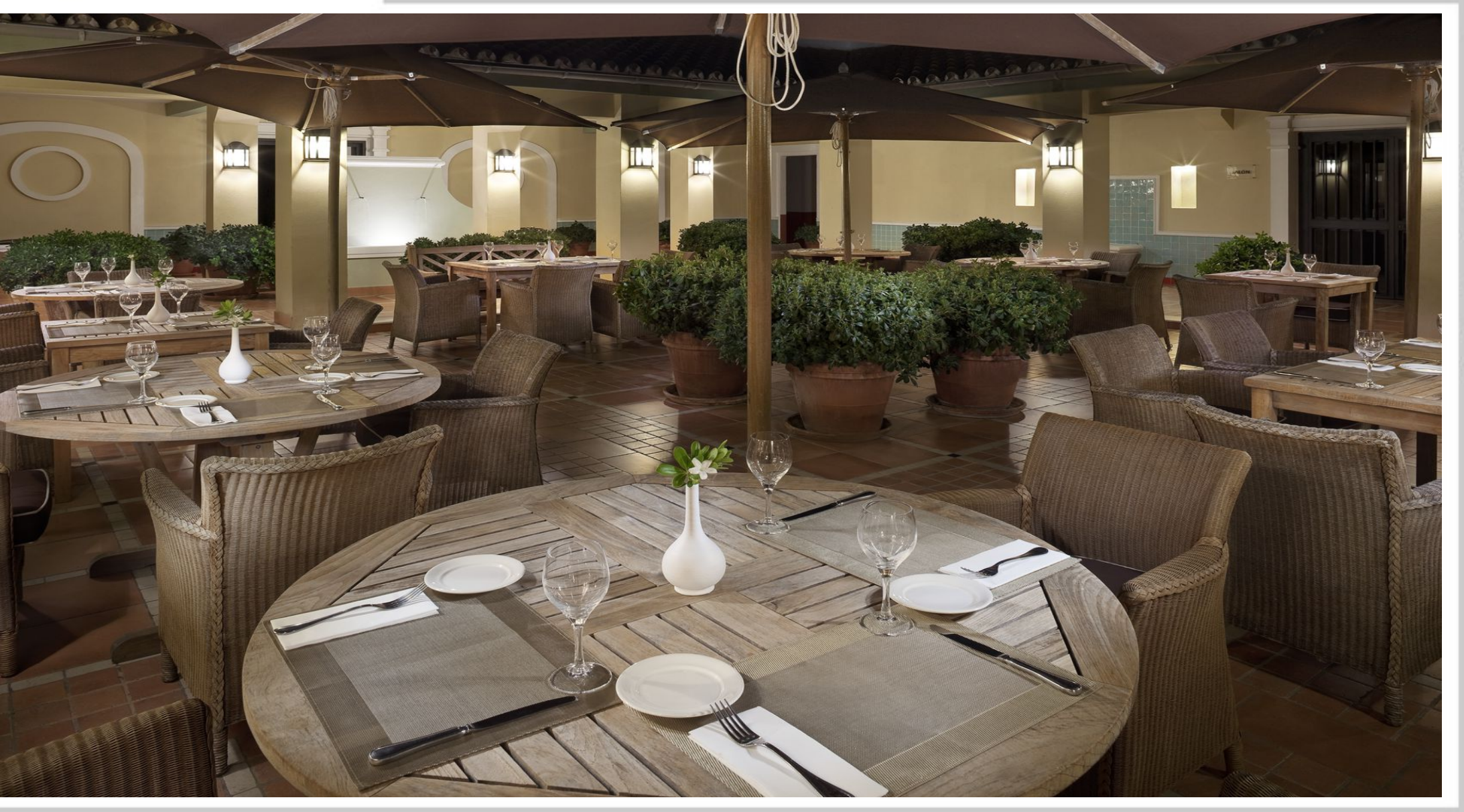
Private & confidential...