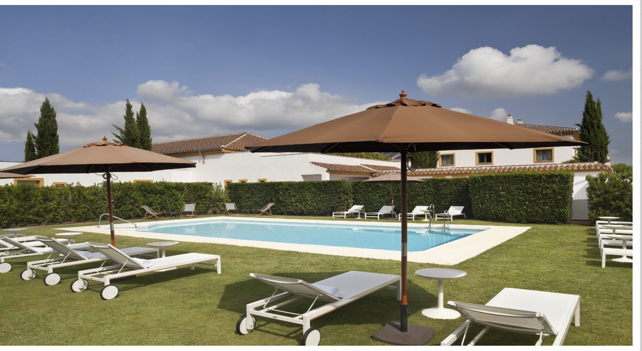
Private & confidential...