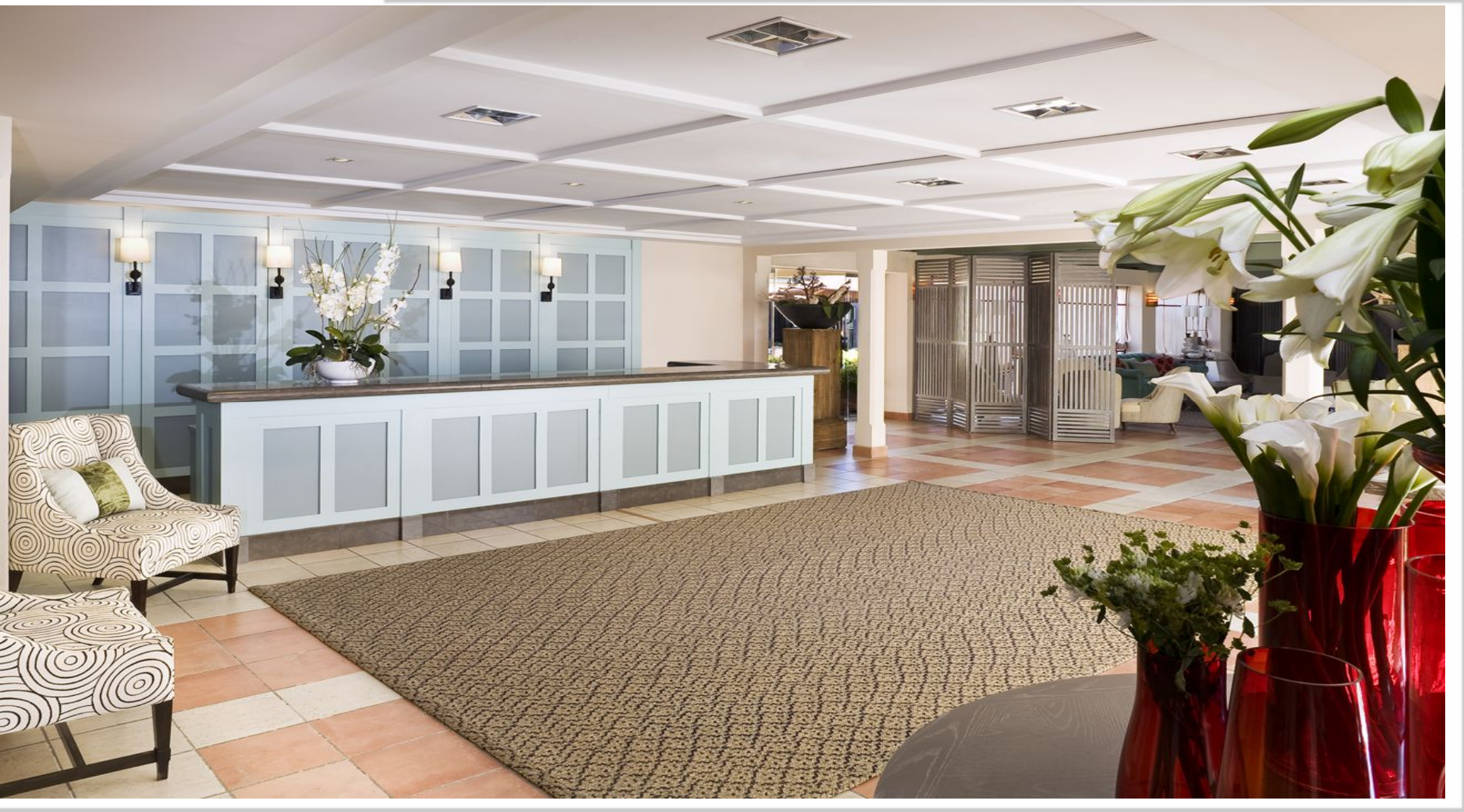
Private & confidential...