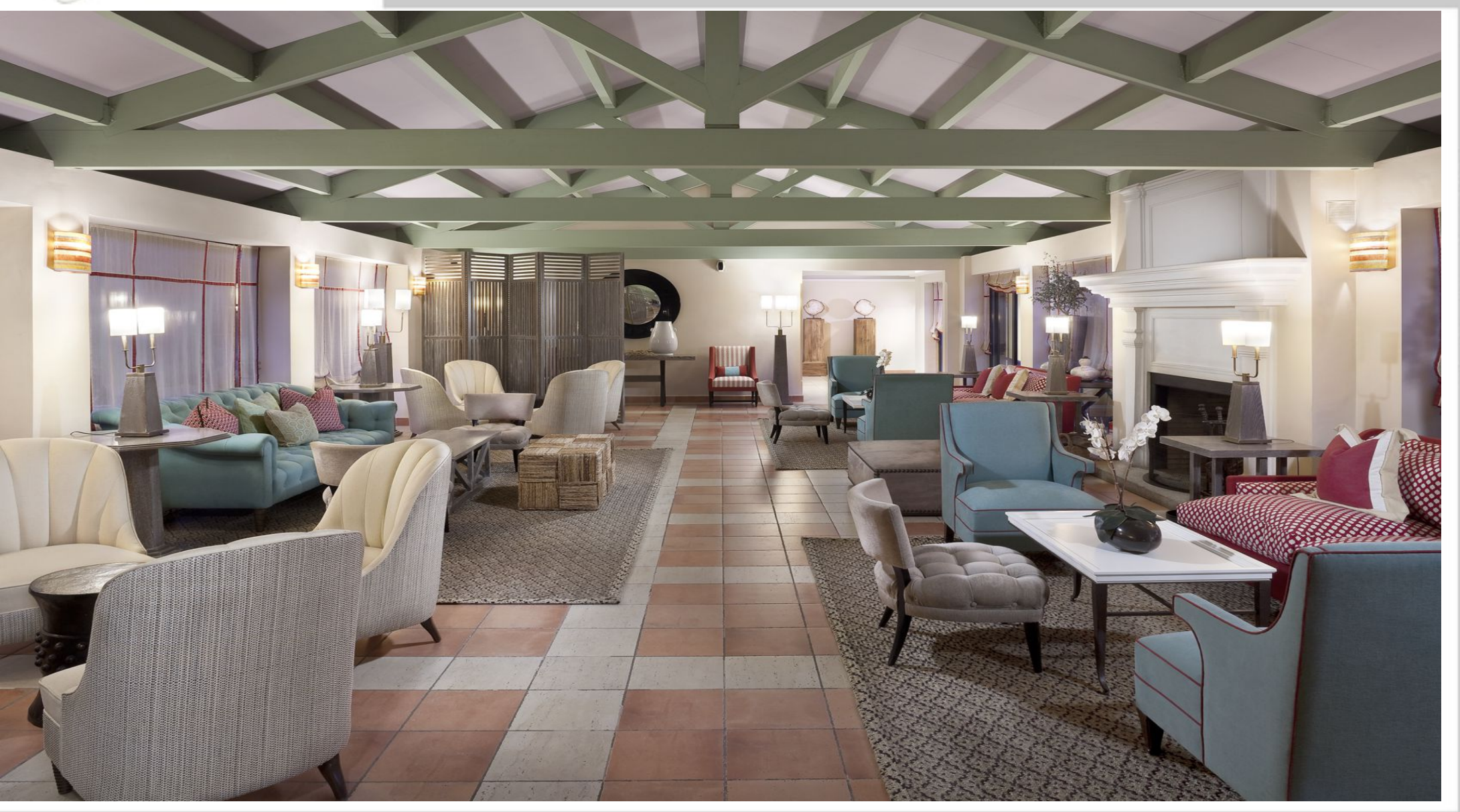
Private & confidential...