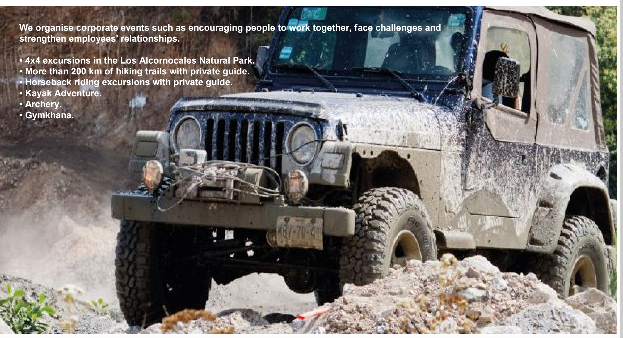
Private & confidential...