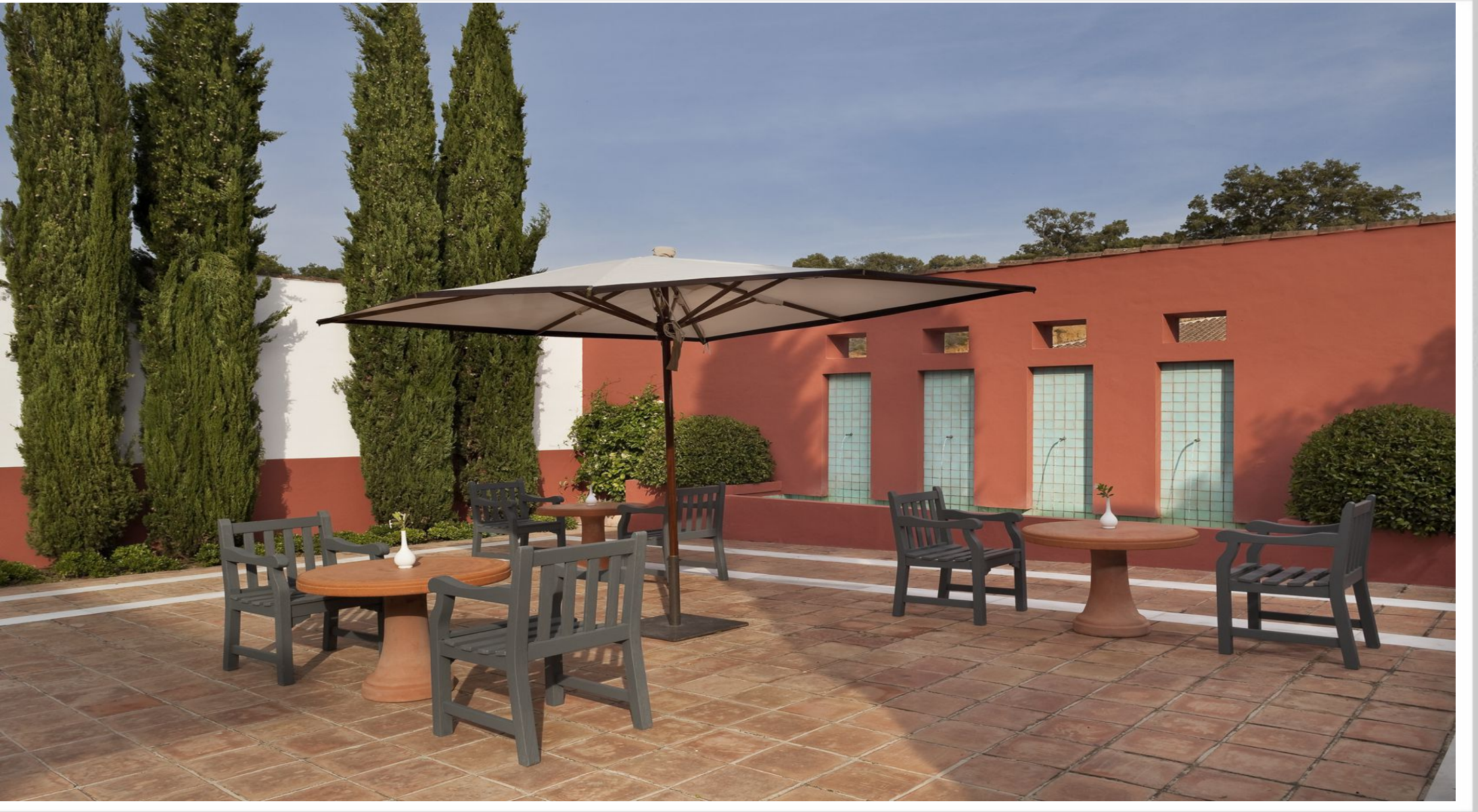
Private & confidential...