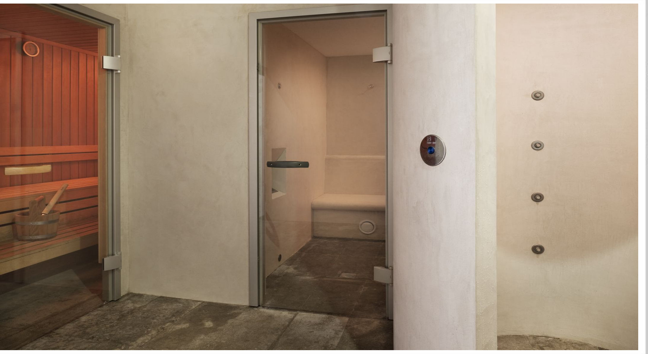
Private & confidential...