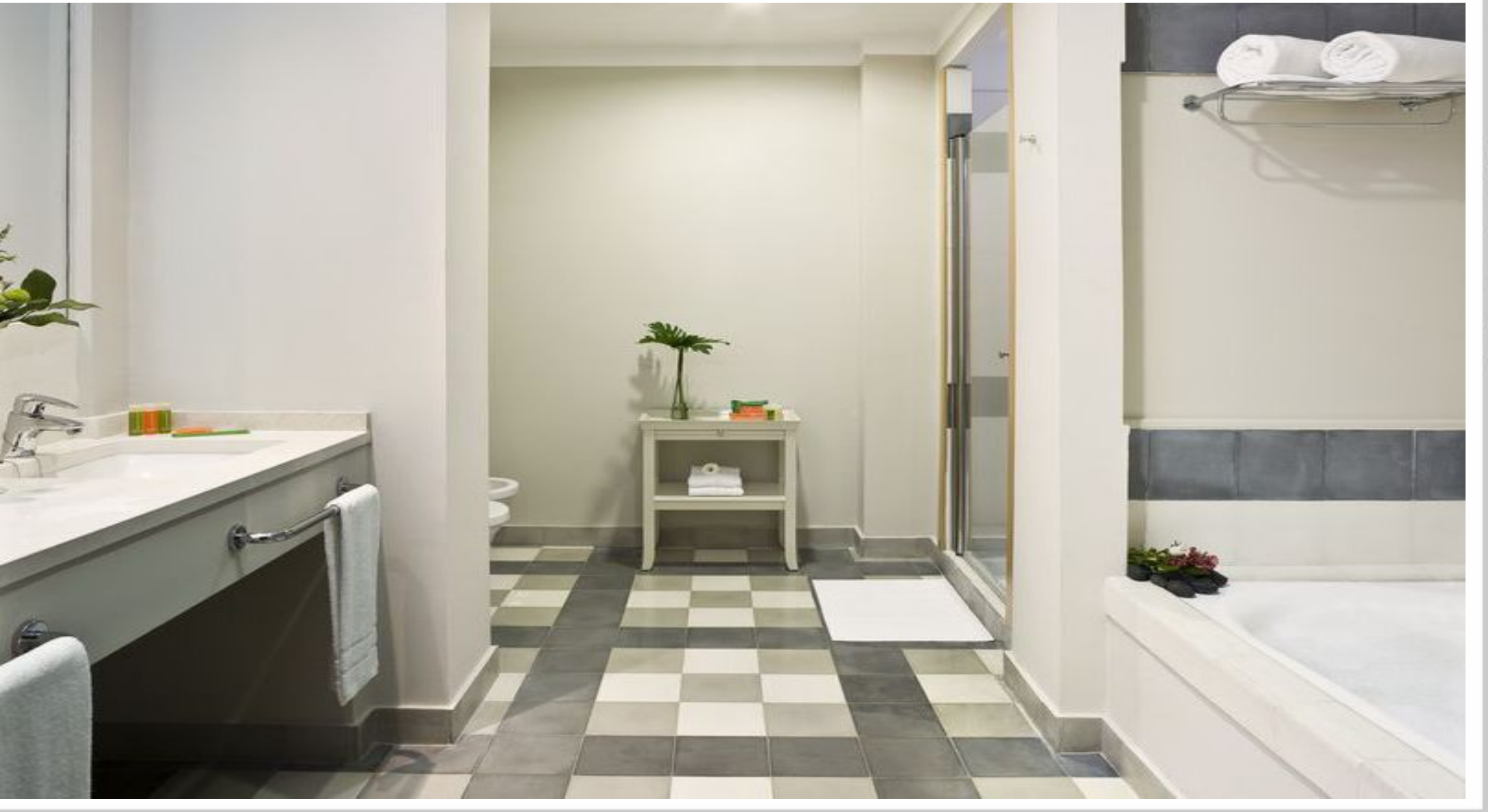
Private & confidential...