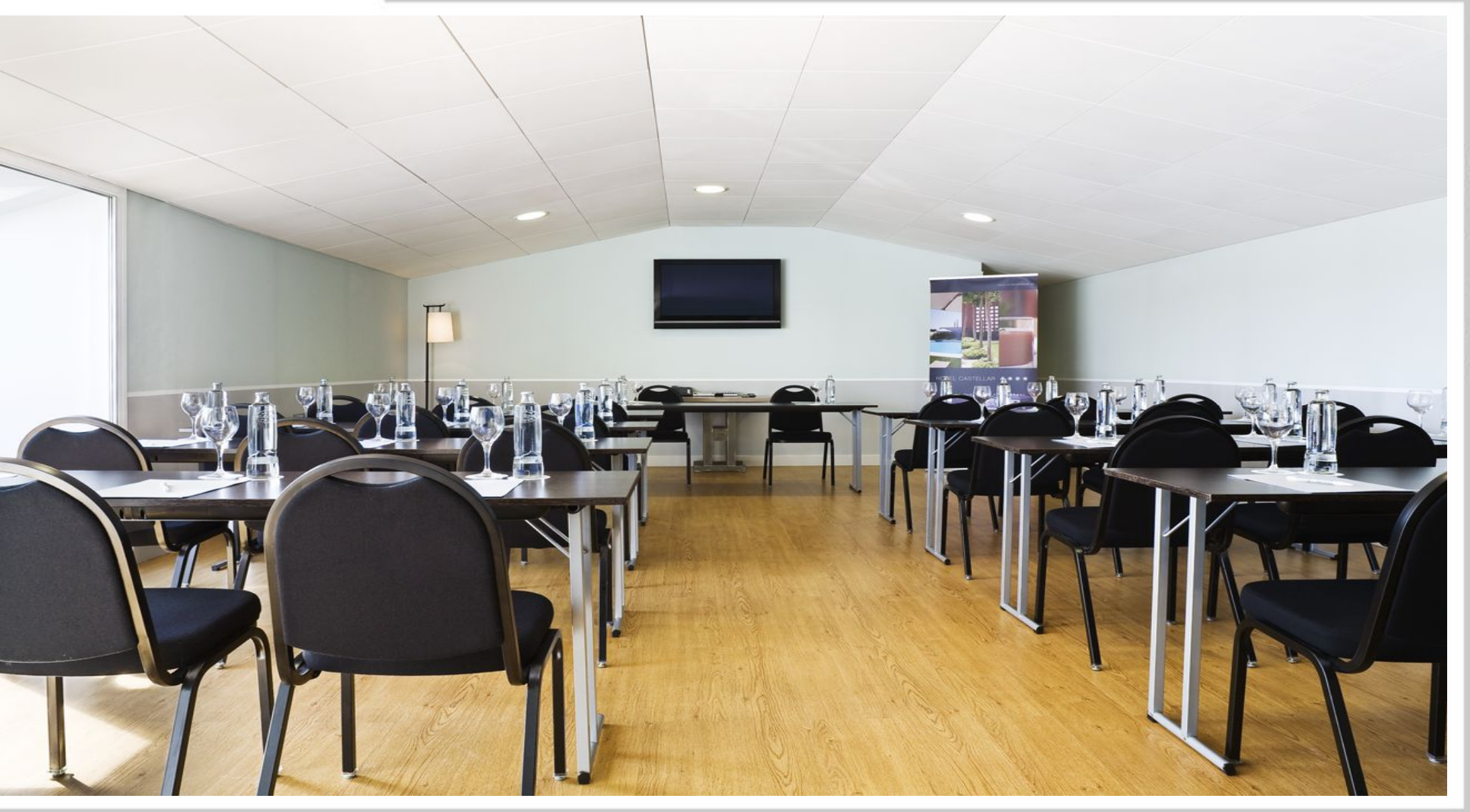
Private & confidential...