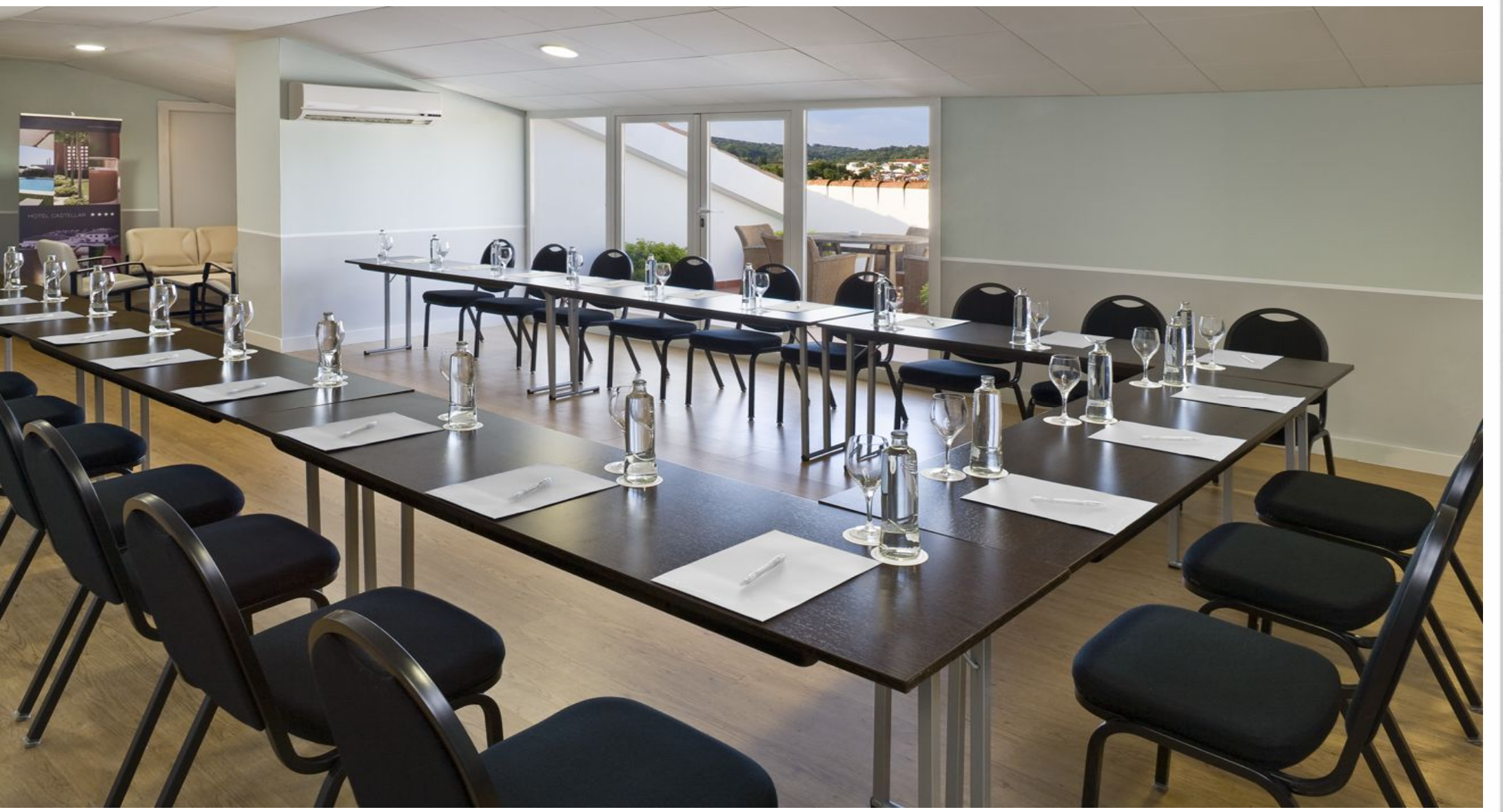
Private & confidential...