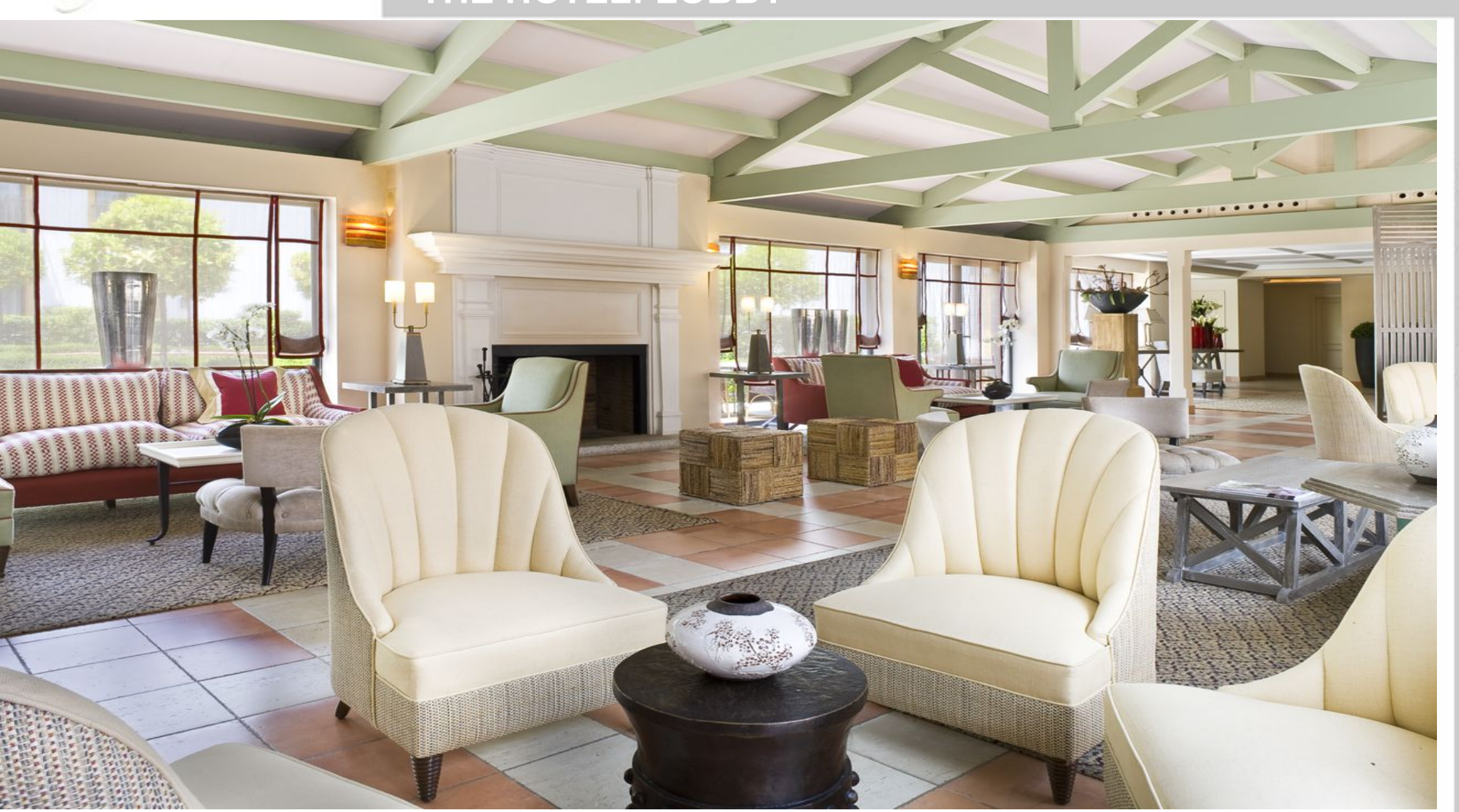
Private & confidential...