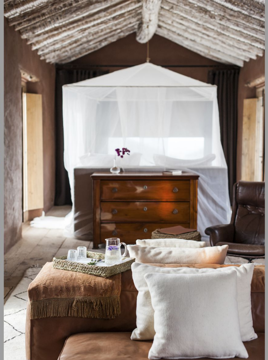
COUNTRY HOUSE IN SIERRA DE RONDA