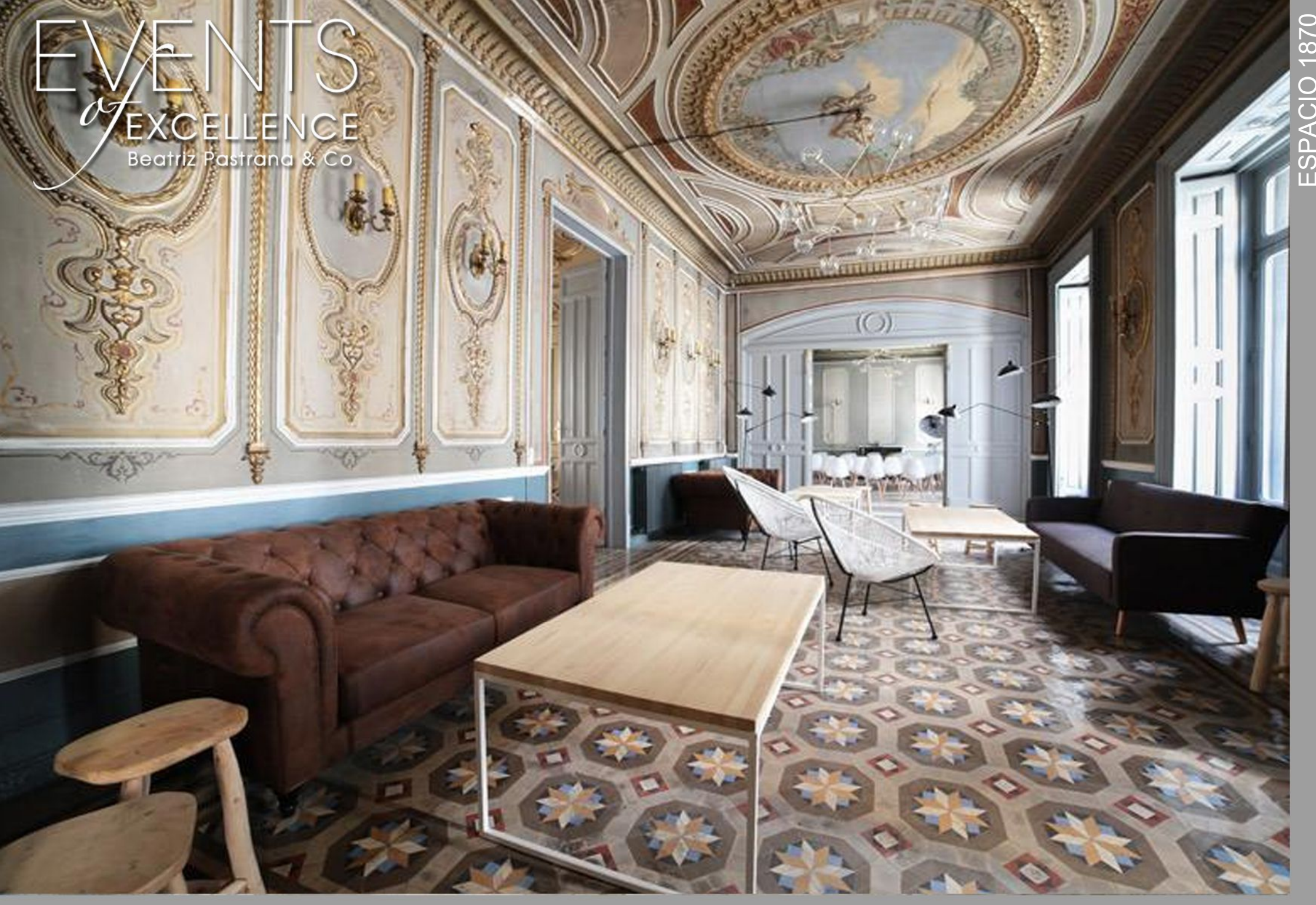
PRIVATE & CONFIDENTIAL