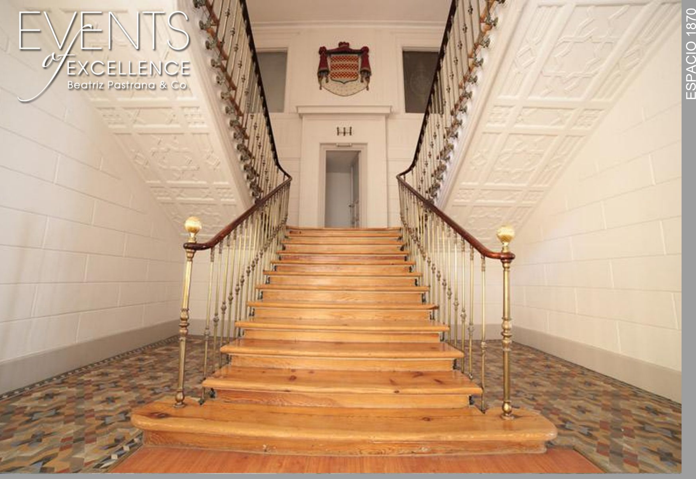
PRIVATE & CONFIDENTIAL