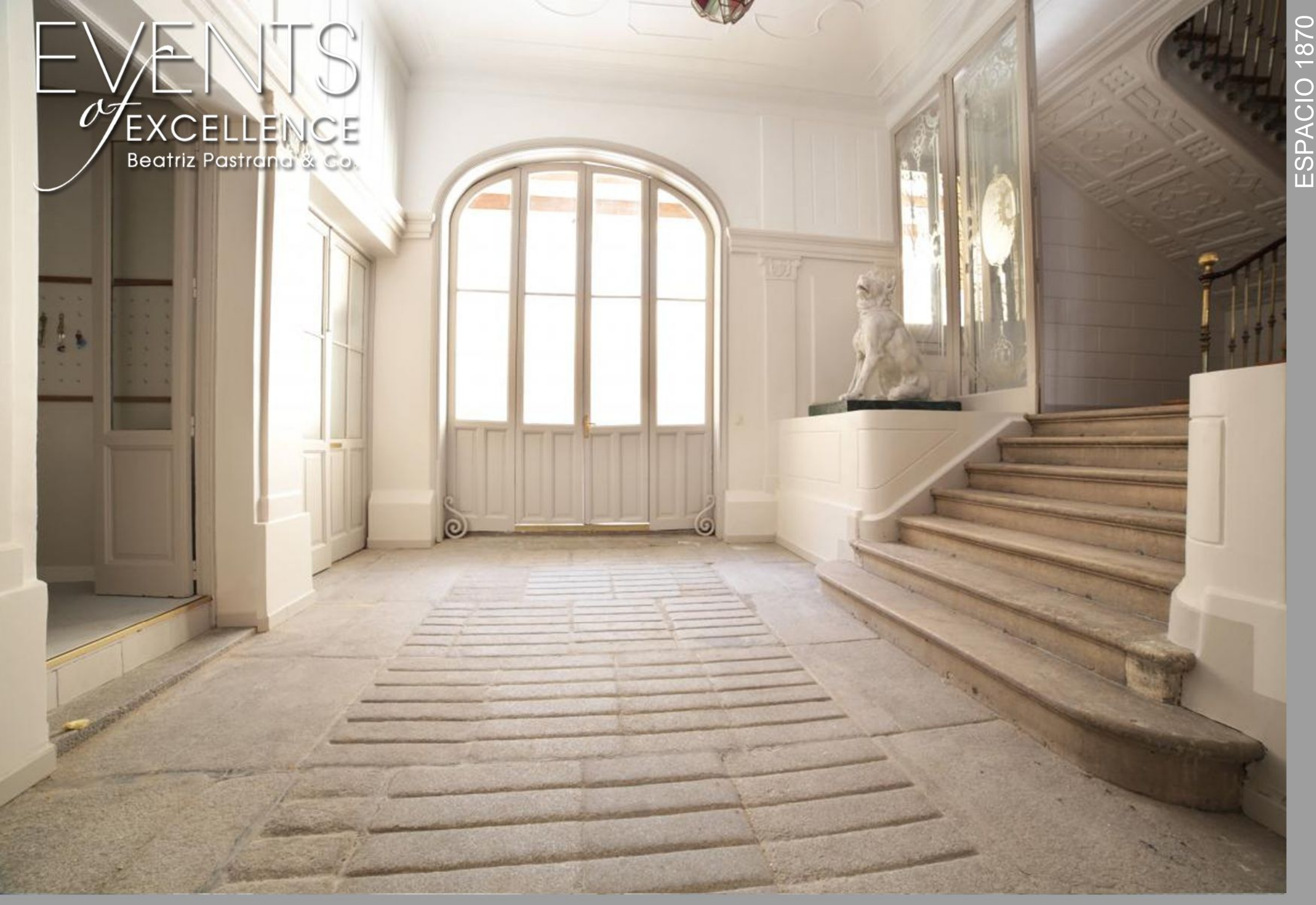
PRIVATE & CONFIDENTIAL