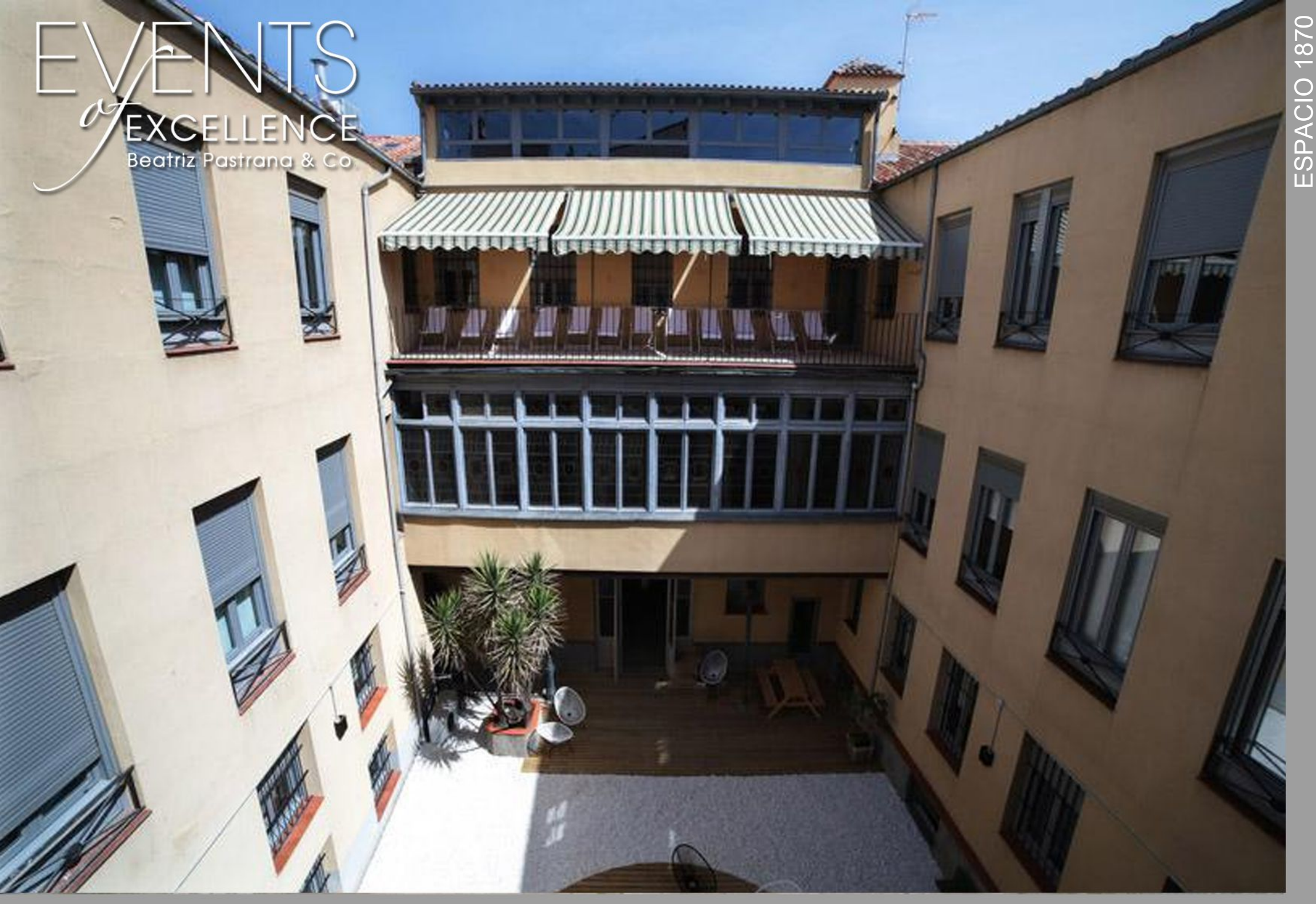
PRIVATE & CONFIDENTIAL