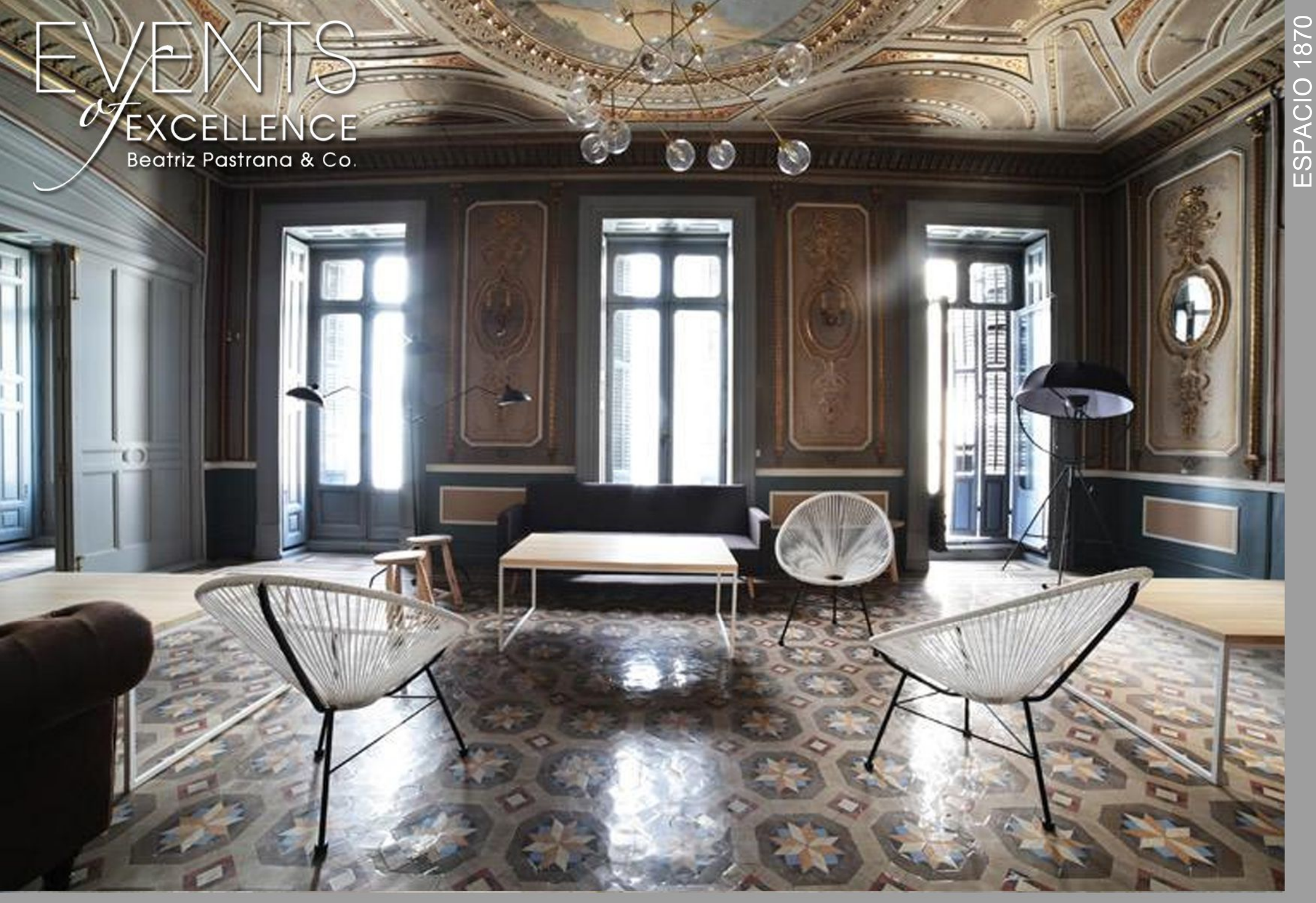
PRIVATE & CONFIDENTIAL