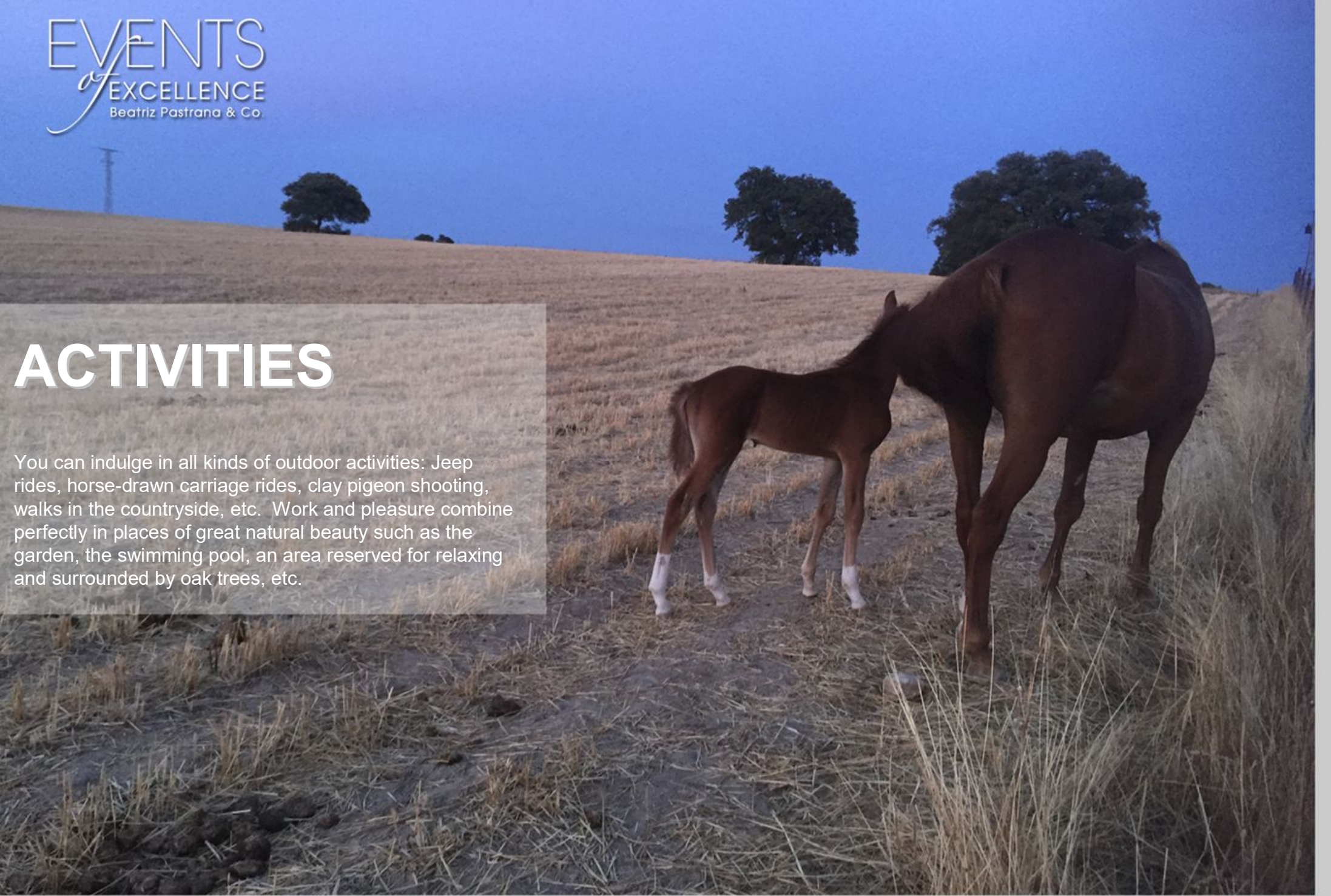
"Private & confidential"