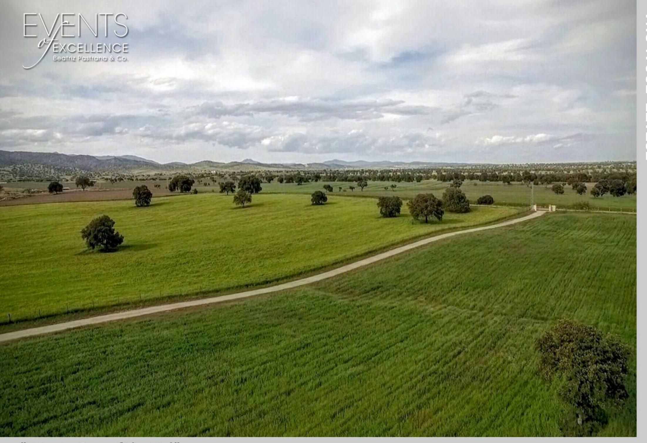
"Private & confidential"