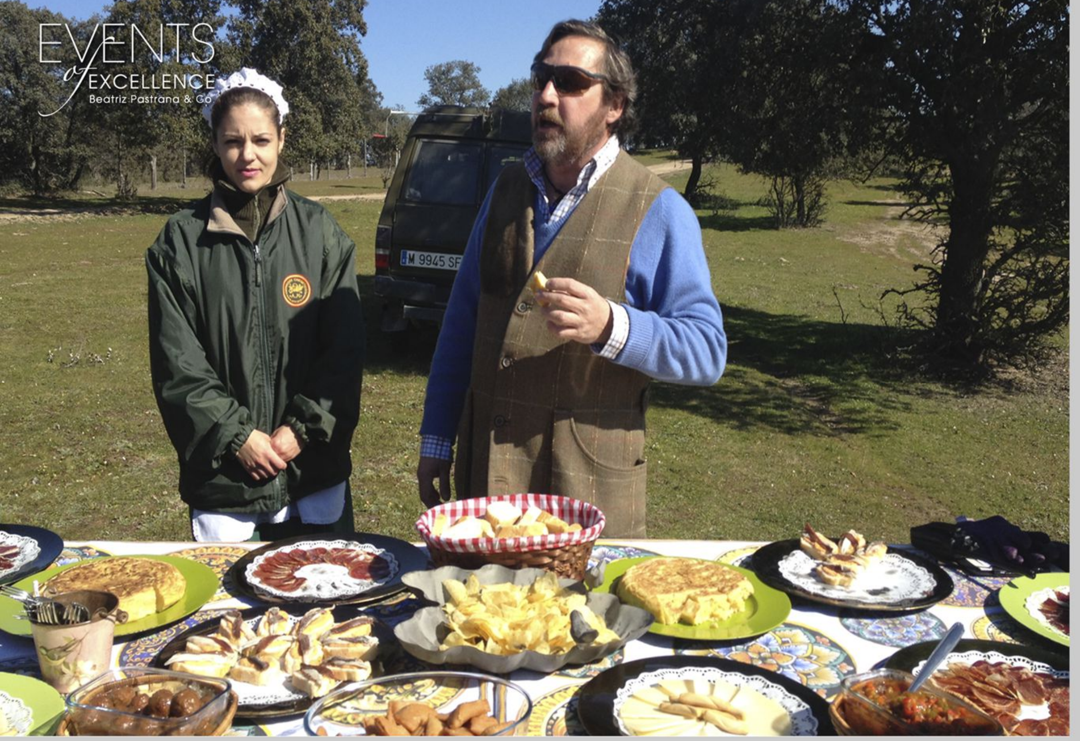
"Private & confidential"