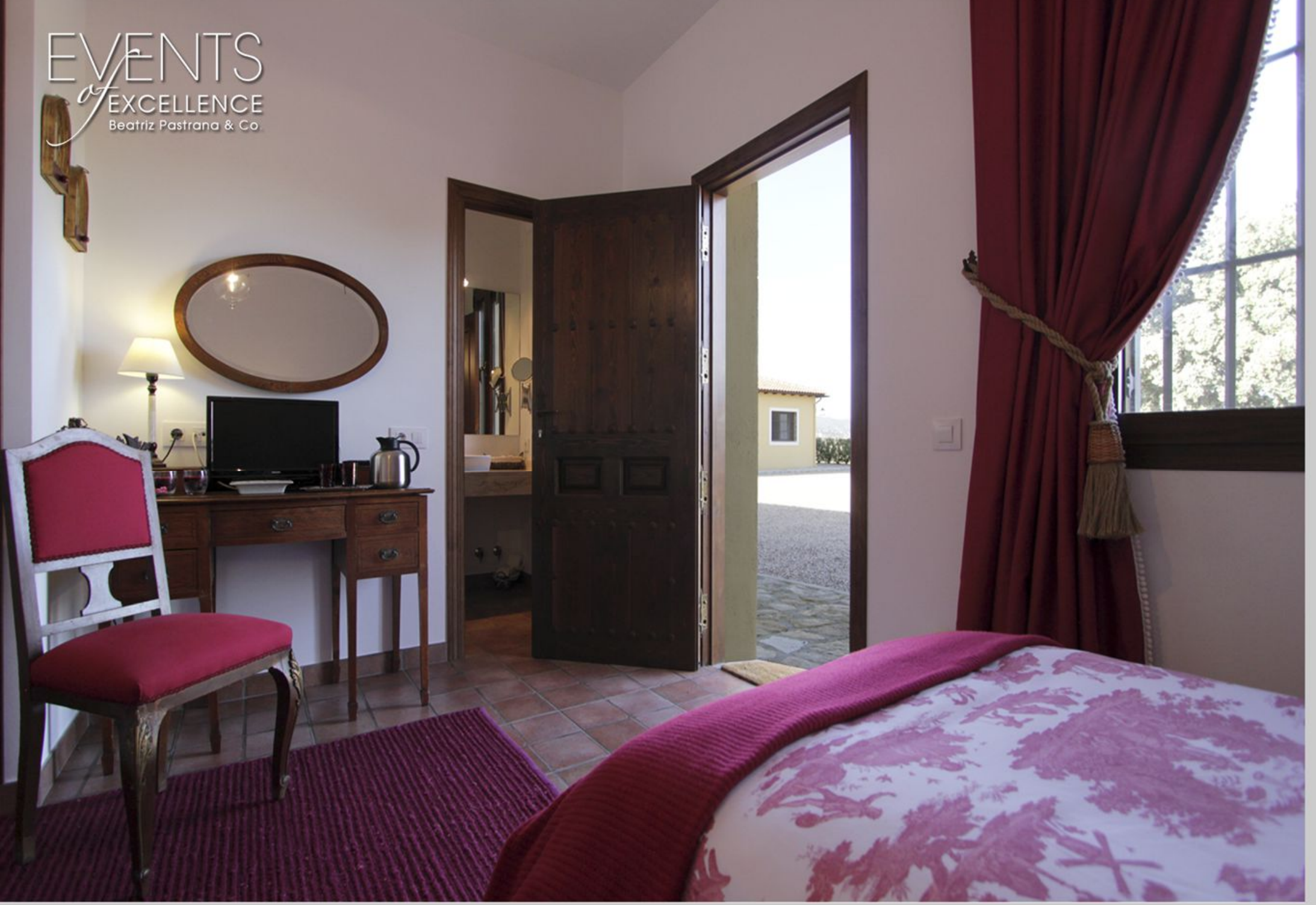
"Private & confidential"