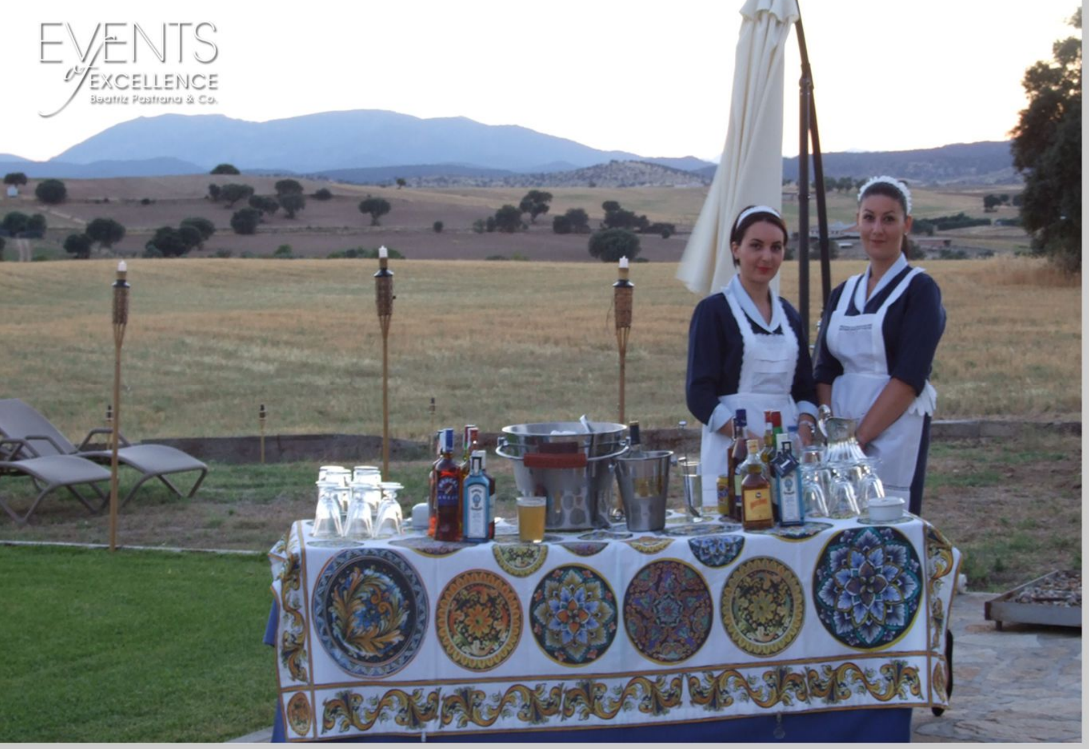
"Private & confidential"