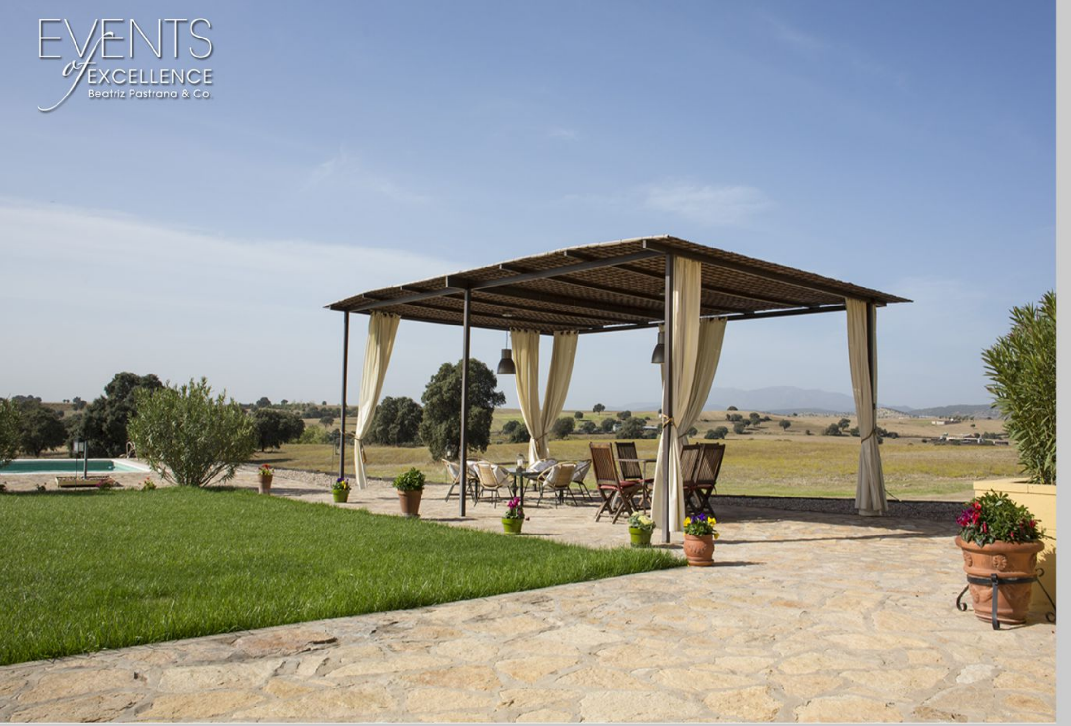
"Private & confidential"