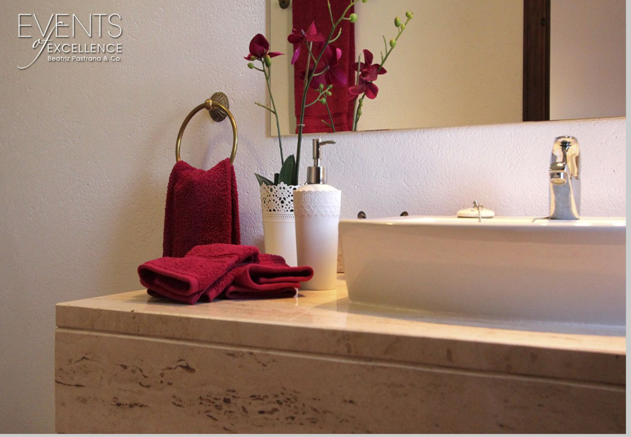
"Private & confidential"