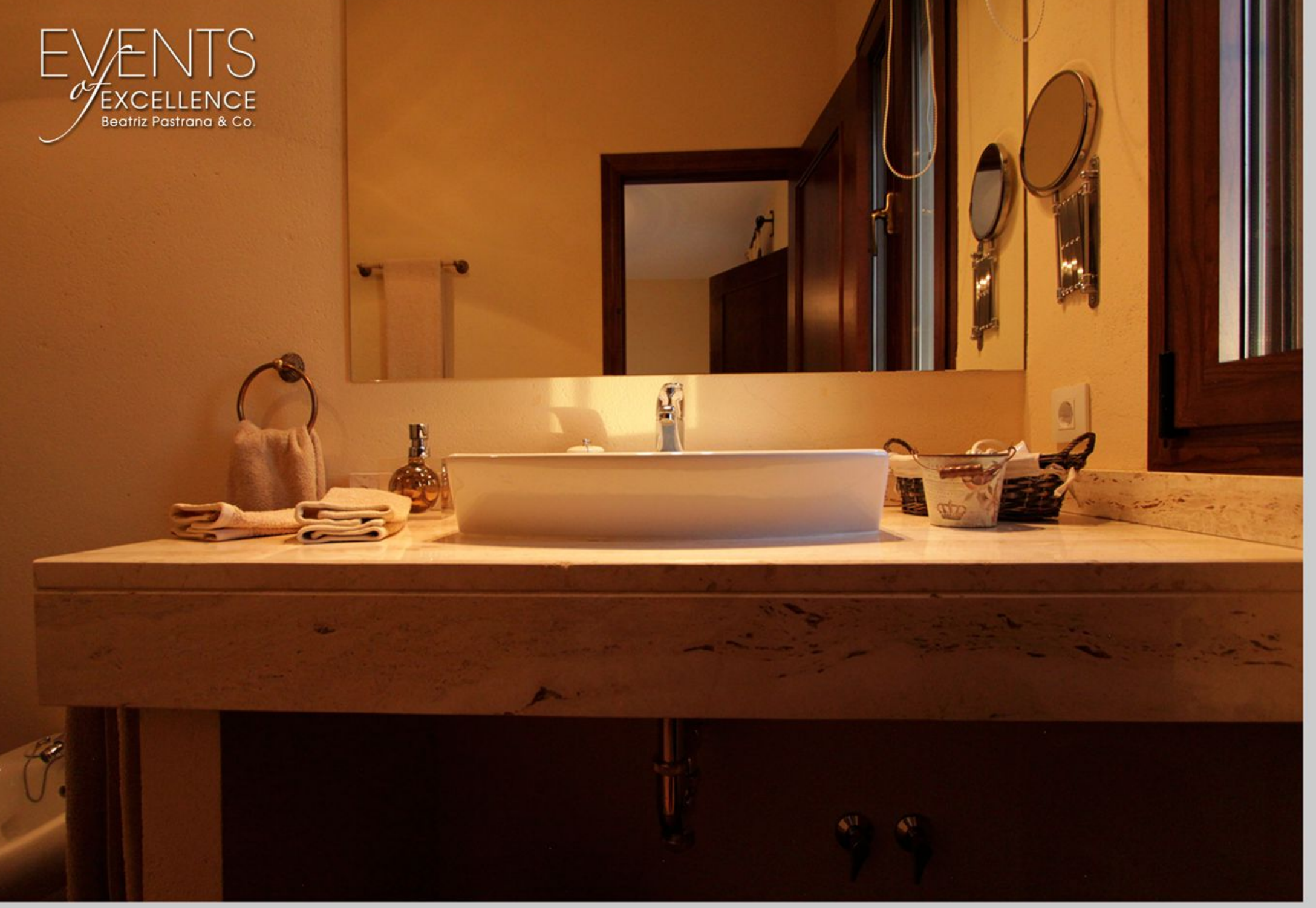
"Private & confidential"