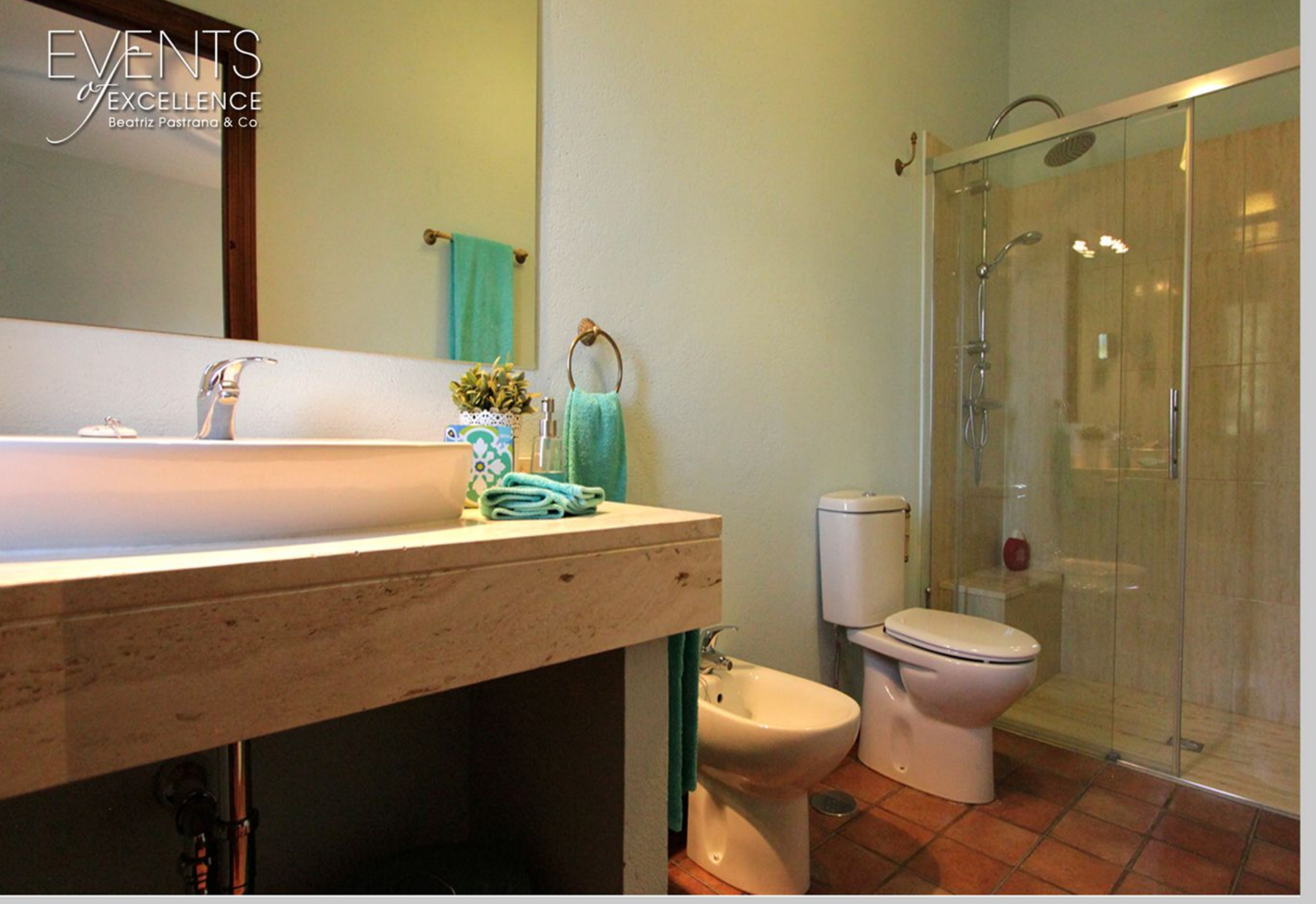
"Private & confidential"