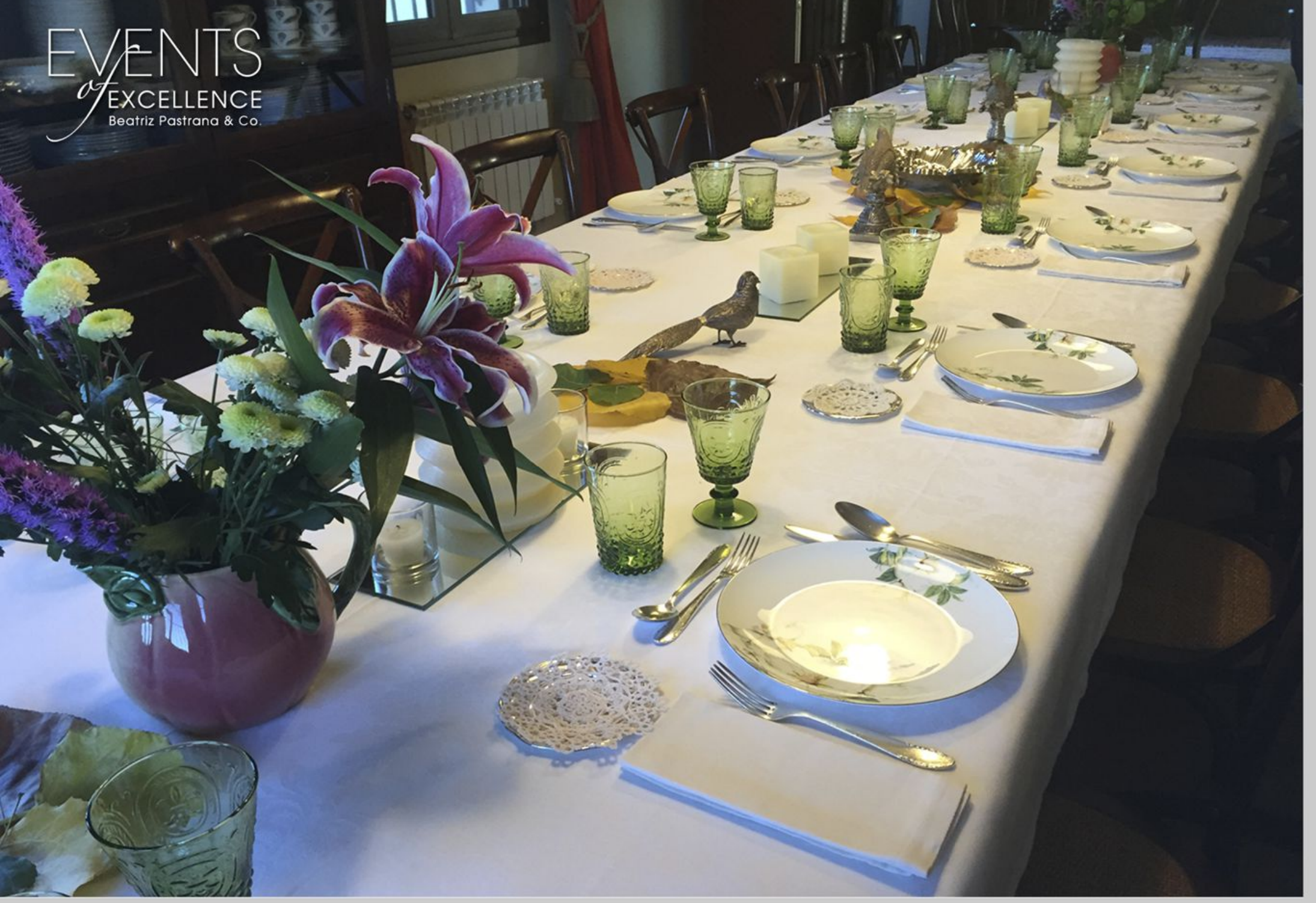
"Private & confidential"