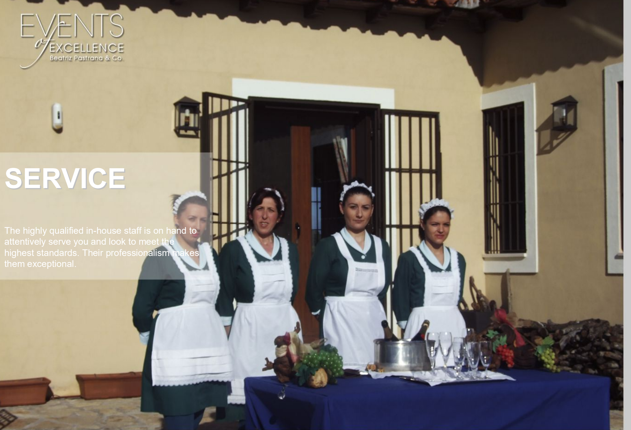
"Private & confidential"