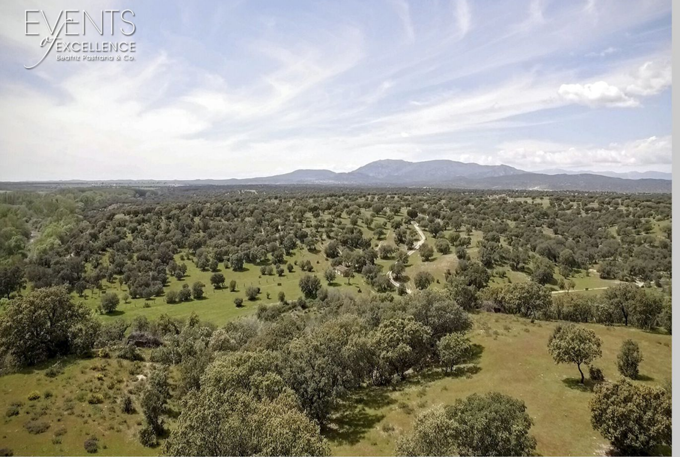
"Private & confidential"