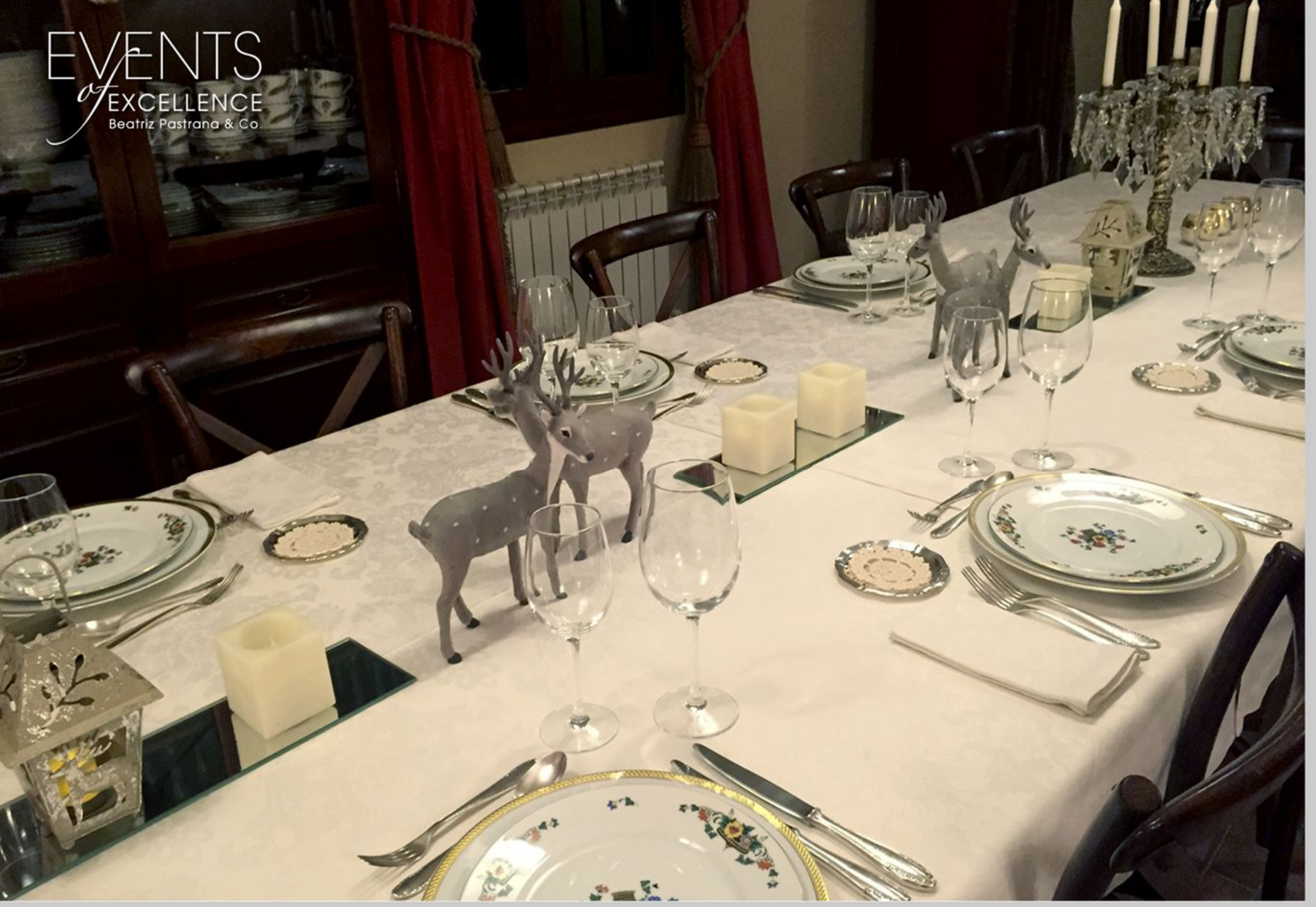
"Private & confidential"