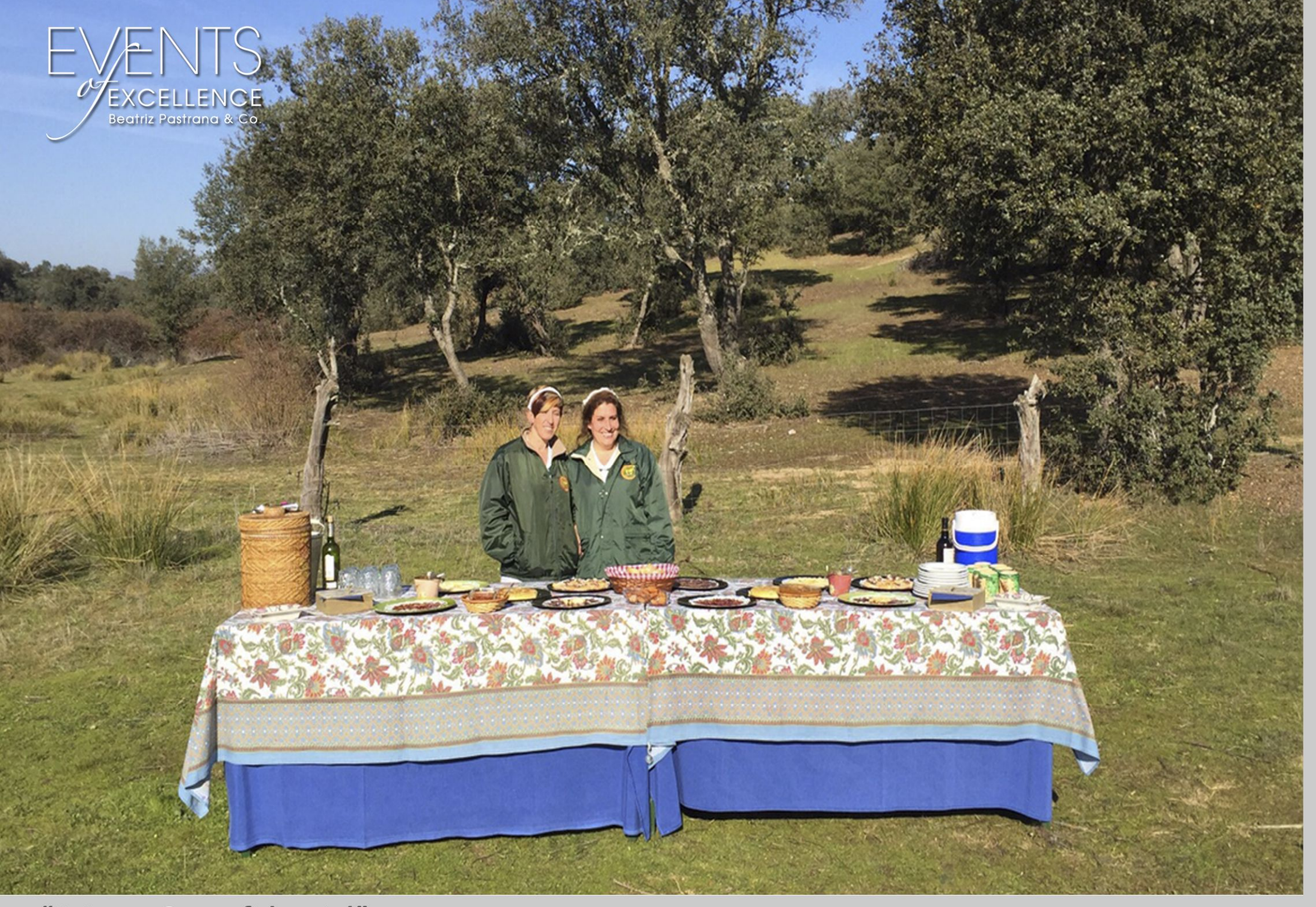
"Private & confidential"