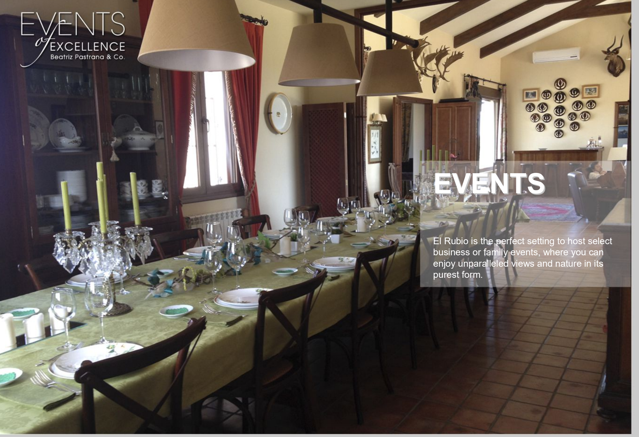
"Private & confidential"