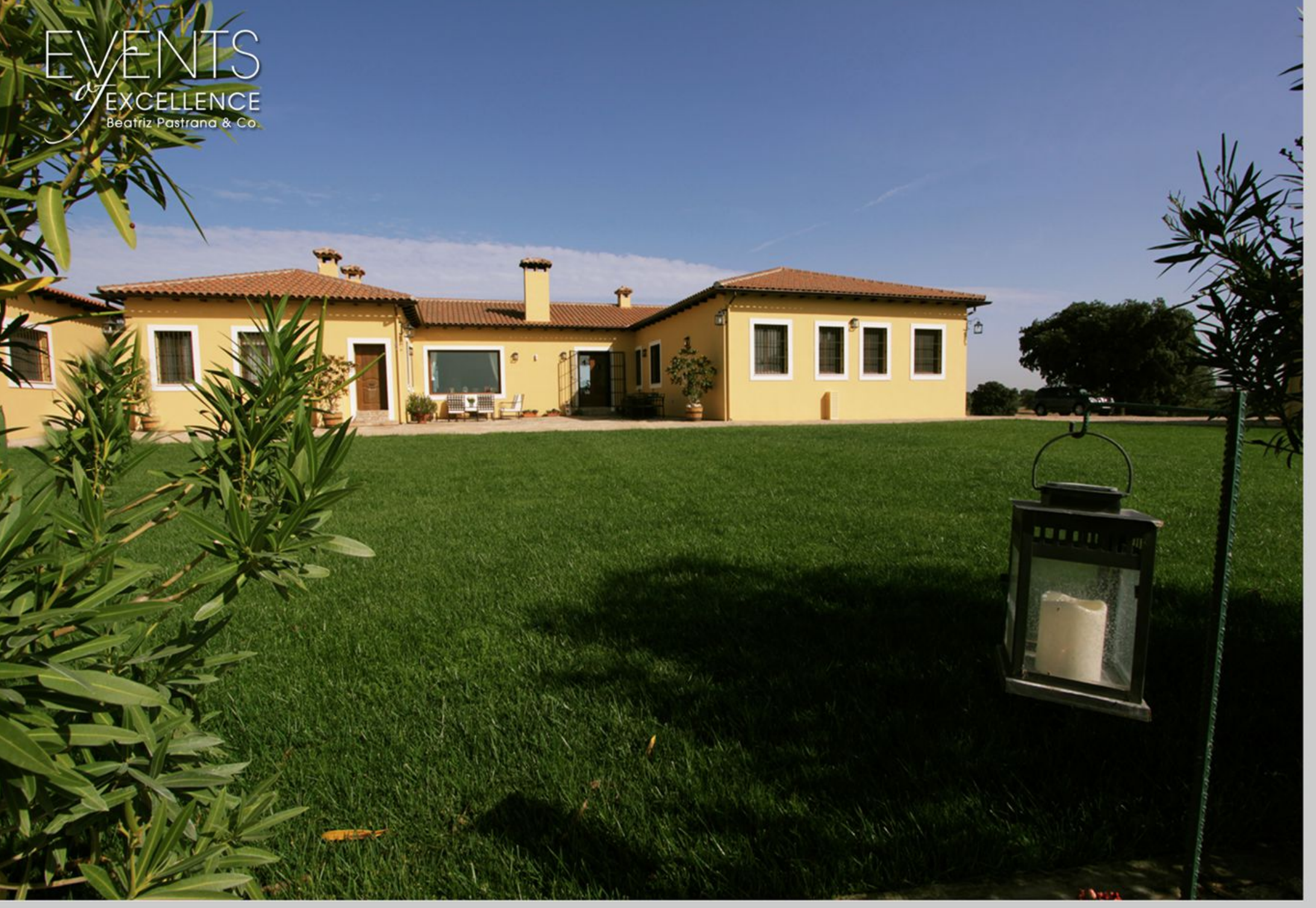
"Private & confidential"