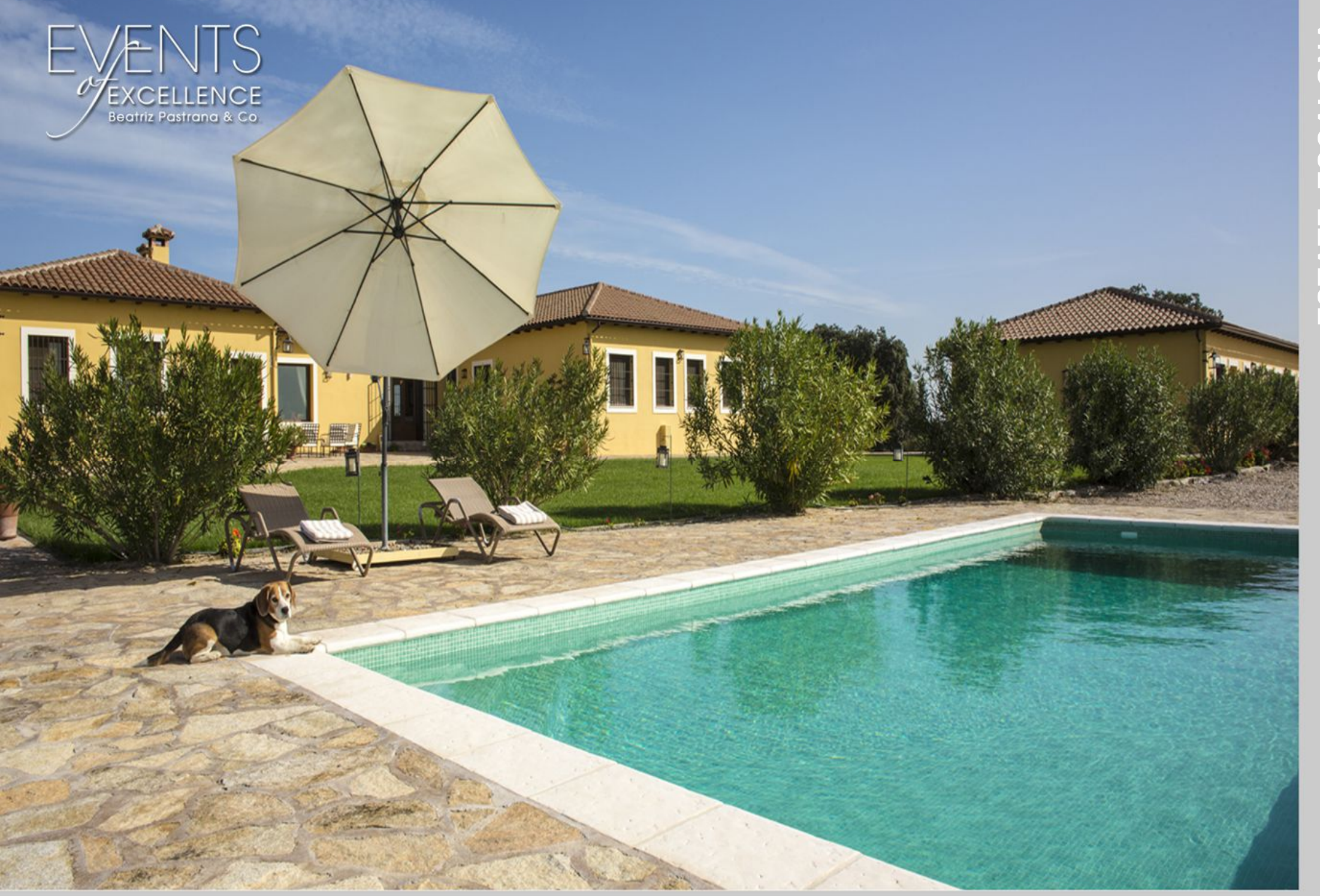
"Private & confidential"