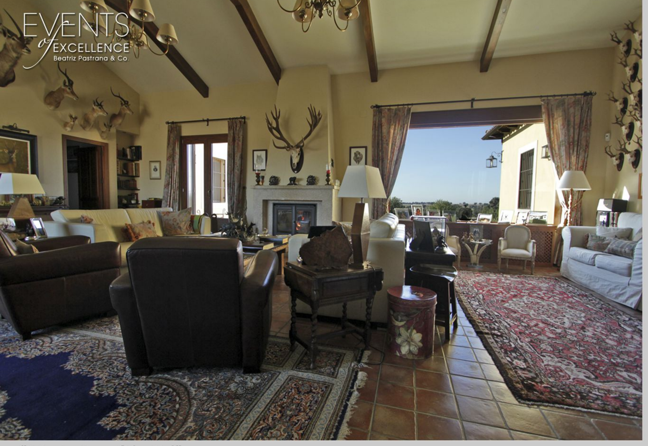
"Private & confidential"