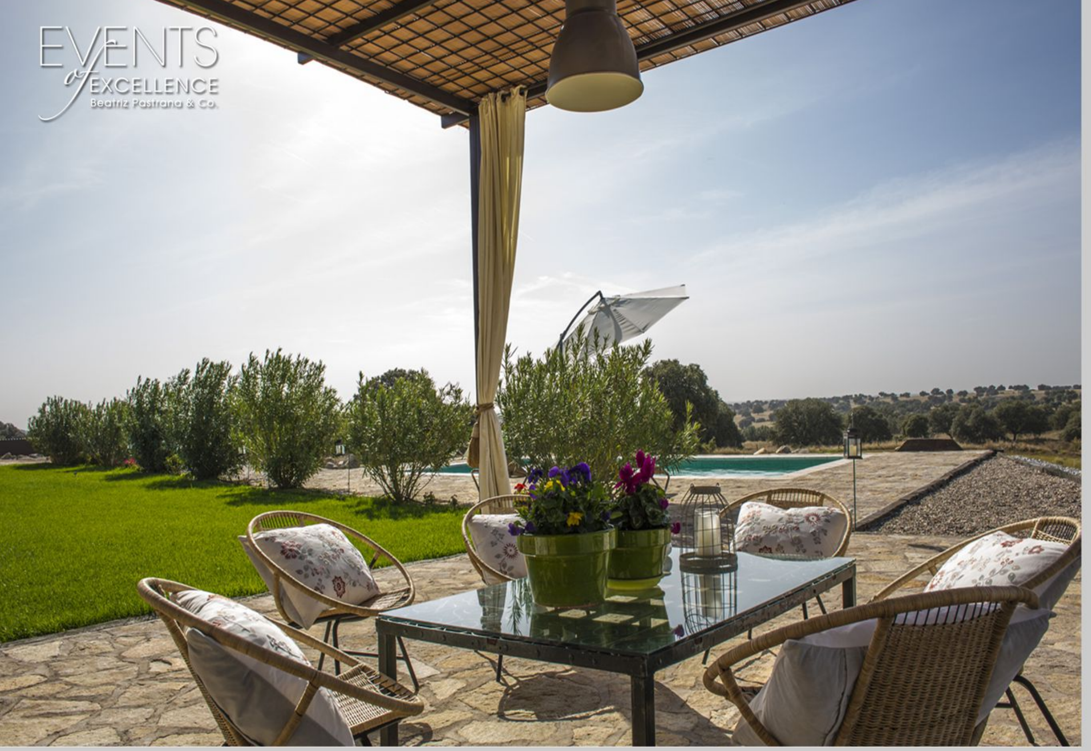
"Private & confidential"