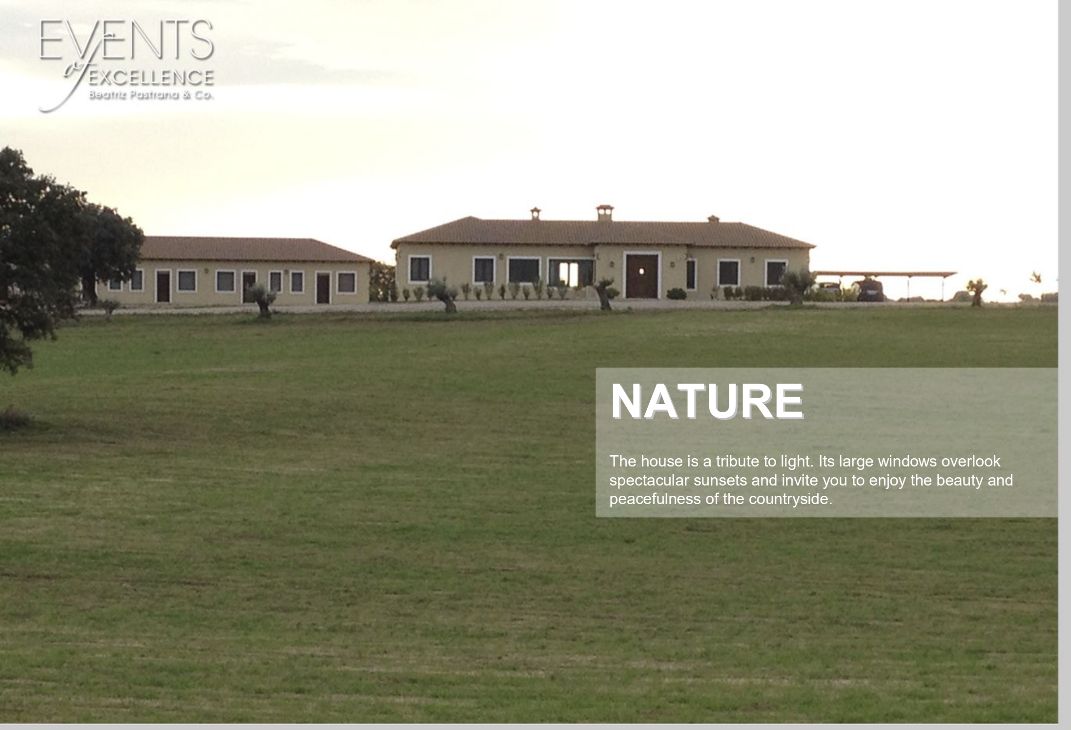
"Private & confidential"